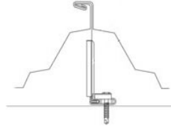
Stratoshield Triple Lok